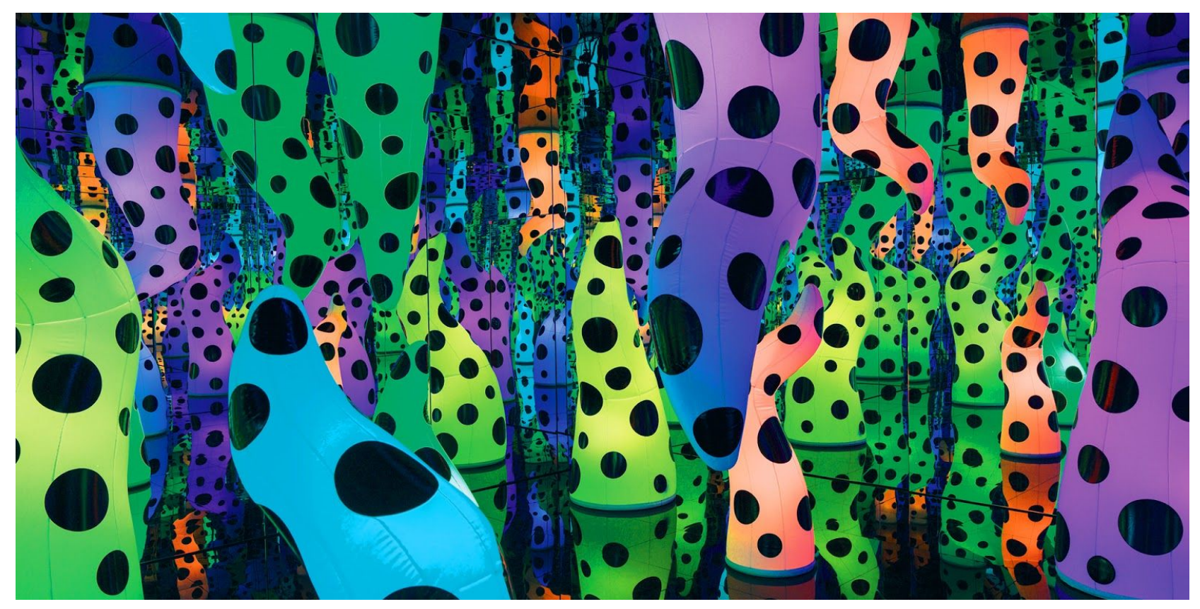
Yayoi Kusama, Love is Calling, printed vinyl installation, 2013